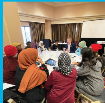
Marriott Hotels of Canada

—Newcomer youth who participated in the Discover+ program hosted by Marriott Ottawa